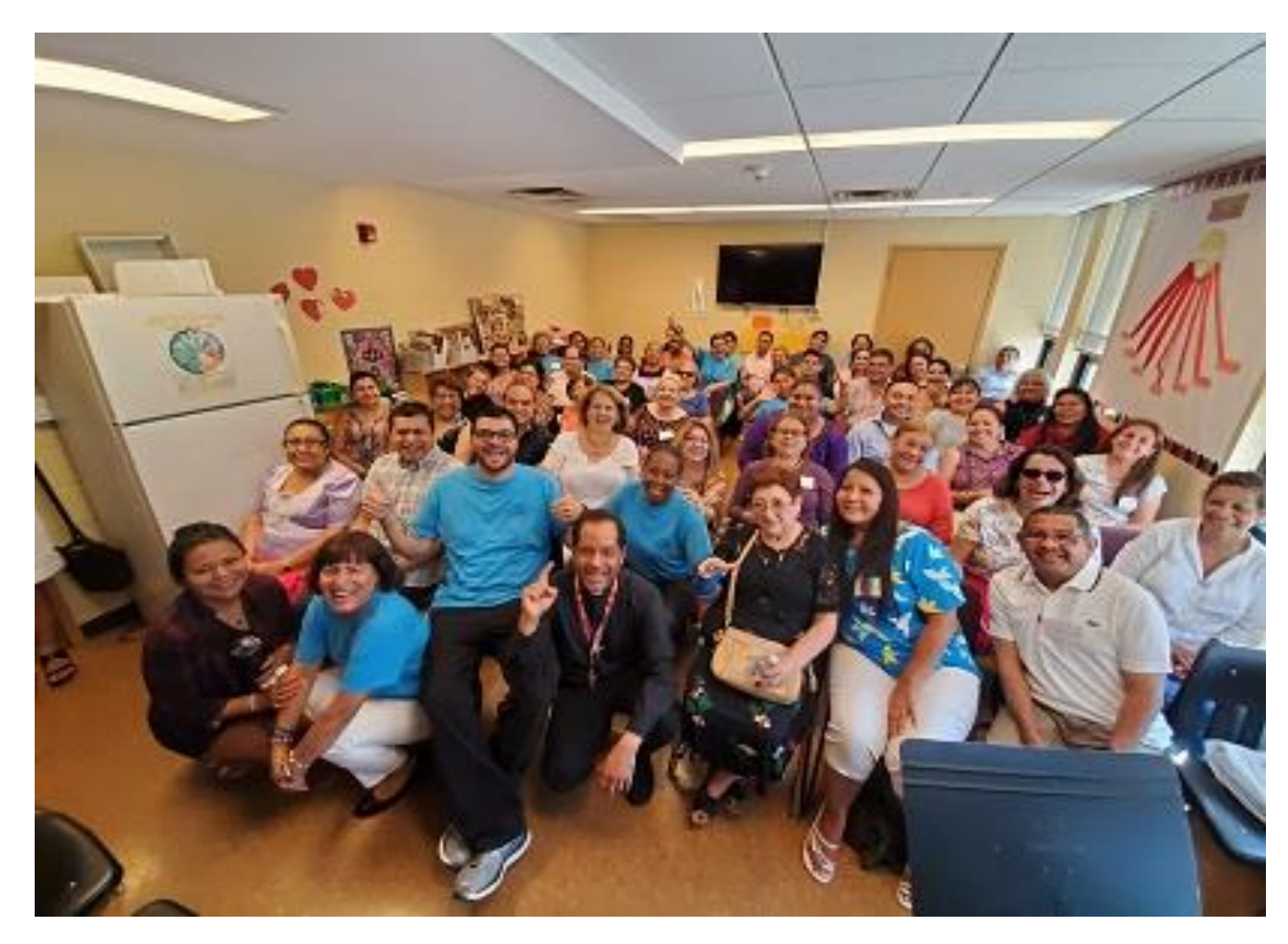
During the three days participants were part of a spiritual process of seven teaching sessions, each one building upon the previous one.

The retreat included speakers from both New York and New Jersey and was accompanied by joyful and spiritual music, prayer times and small group meetings where the participants shared their point of views, asked questions and formed a small community. More than 80 parishioners participated in this annual retreat which has an objective to: 1) Begin, renew or deepen a relationship with Jesus, 2) Motivate parishioners to a fuller participation in Parish Life, 3) Developed greater appreciation of Eucharist, 4) Deepen prayer life and 5) Increase study of Scripture.